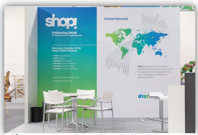
12 sqm complete package with standard booth construction and extra artwork