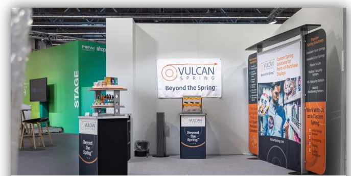
12 sqm complete package with standard booth construction and decoration by exhibitor